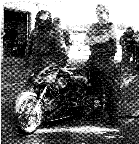
INNISFAIL PROVINCE PHOTO submitted